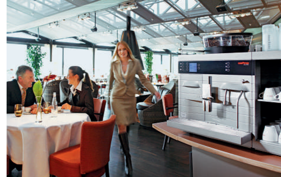
The new Cafina ALPHA puts coffee enjoyment at center stage.