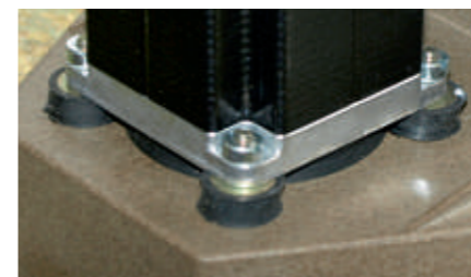
Custom-fabricated round buffers from Angst+Pfister for the Cafina ALPHA models.

In a special series of tests, the engineers at Angst+Pfister documented how the spring characteristics of the rubber-metal buffers change at high temperatures. An exactly calibrated composite mixture of EPDM and CR emerged as the ideal material combination. EPDM stands for ethylene propylene diene M-class rubber and CR stands for chloroprene rubber, which is also called neoprene. EPDM is well known for its excellent thermal resistance properties. The test results were immediately put into practice: today Angst+Pfister supplies the Cafina company with custom-fabricated round buffers that are optimally adapted to the Cafina ALPHA line of coffee machines.